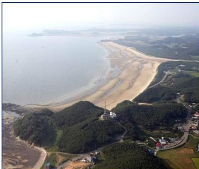
Figure 1. World Meteorological Organization (WMO) regional Global Atmosphere Watch (GAW) station at Anmyeondo, Korea.