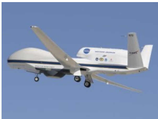
Figure 1. The NASA Global Hawk UAS.